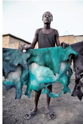
8 - Assada / Tannery / Niamey