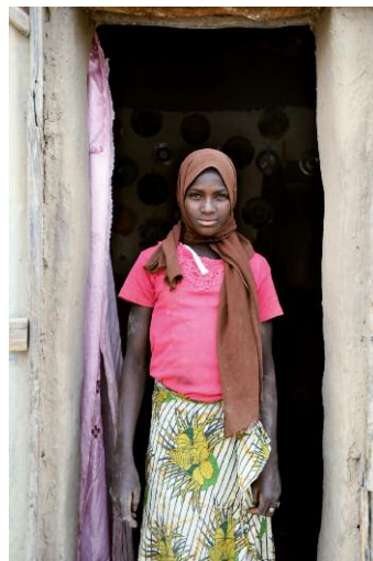
4 - Cabin