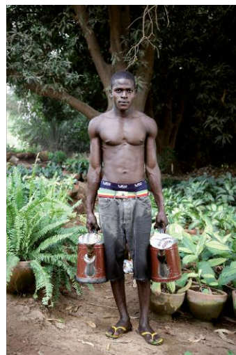
6 - Azize / Vegetable Gardens / Niamey