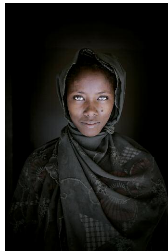
12 - Ominta / Barn / Téra