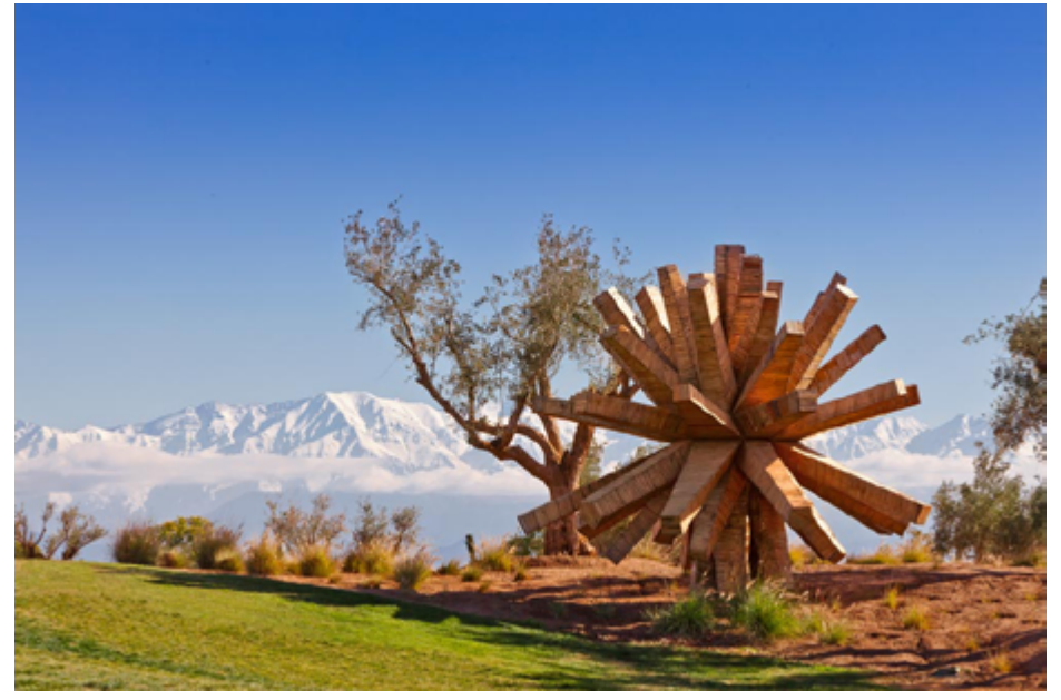
Al Maaden Sculpture Park Moataz Nasr (Egypt) - Wooden Crystal - 2013 Wooden boards assembled on a steel structure 4,5x4,5x4,5 metres