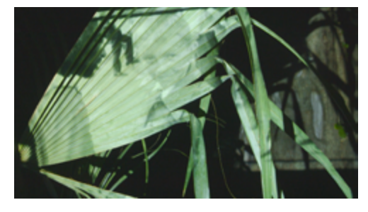
Filipa César (Germany) Spell Reel - 2017 96'